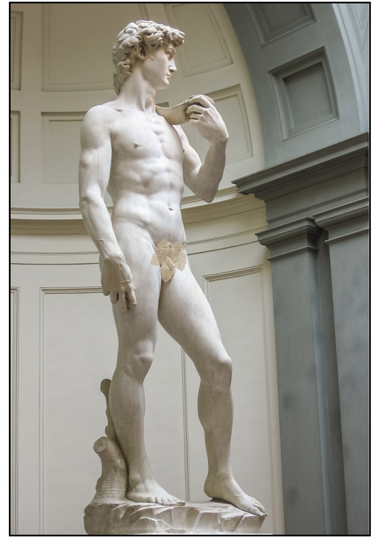
Original intended place for Michelangelo's statue of David