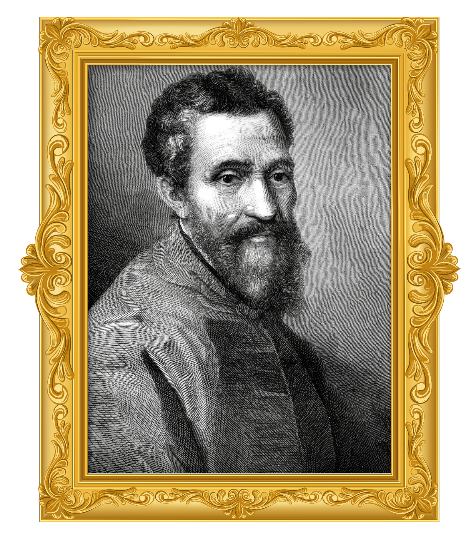
This is an engraving of Michelangelo from the 1800s.