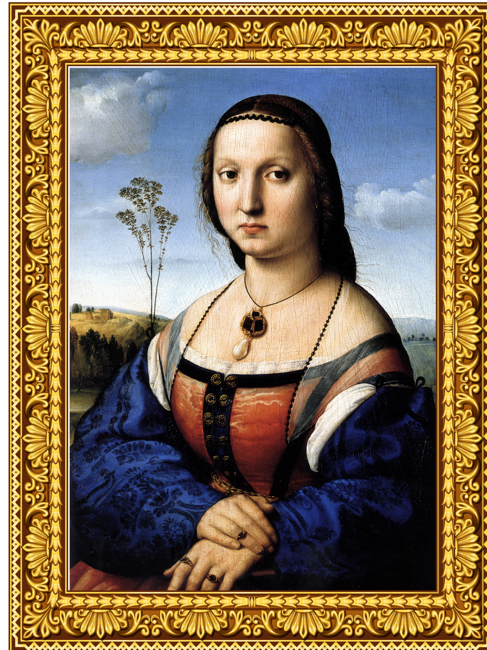
Portrait of Portrait of Maddalena Strozzi Doni