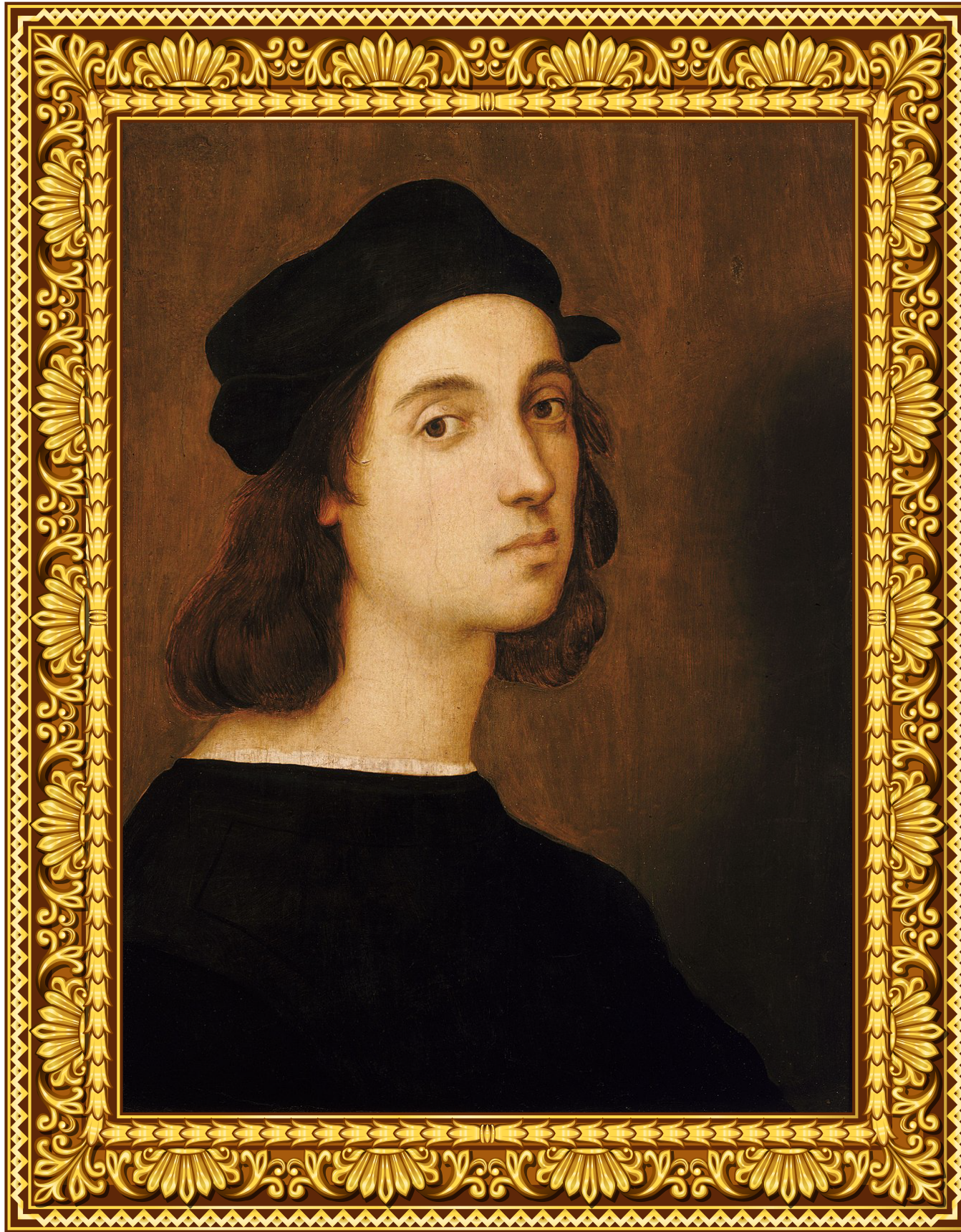
Self Portrait, 1504–1506, oil on board, 47.5 cm × 33 cm (18.7 in × 13 in)

Raphael spent twelve years working in Rome. After a sudden, short illness Raphael died at the age of 37.