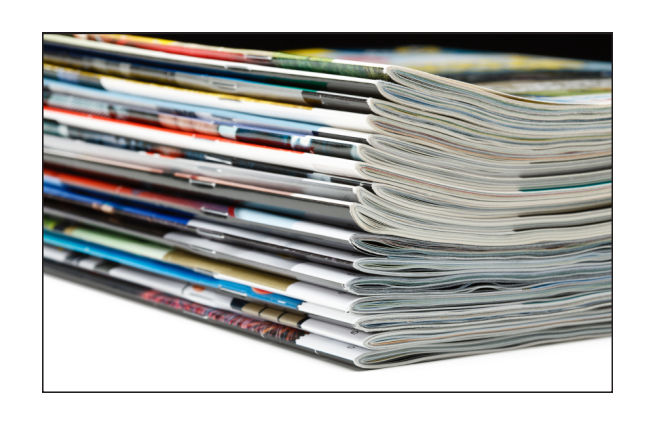
shiny paper (from old magazines)