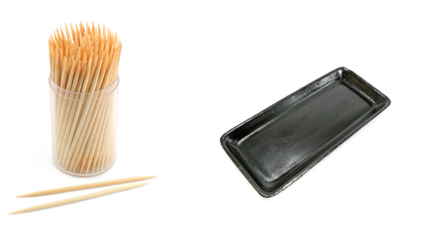
wooden toothpicks and something to stick them into (a polystyrene tray, for example)