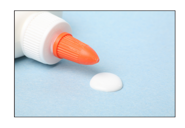
craft glue and a brush