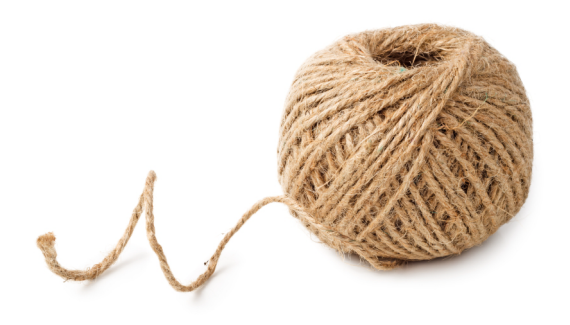
a length of string