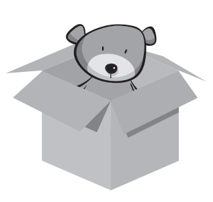
Teddy is inside the box.