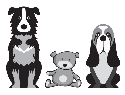
Teddy is in between two dogs.