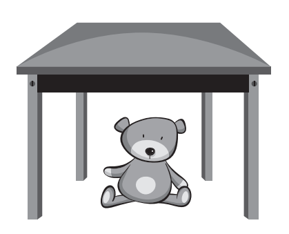
Teddy is under the table.