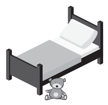
Teddy is next to the bed.