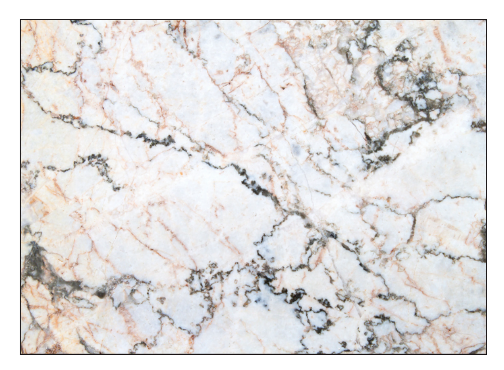
marble (metamorphic rock)