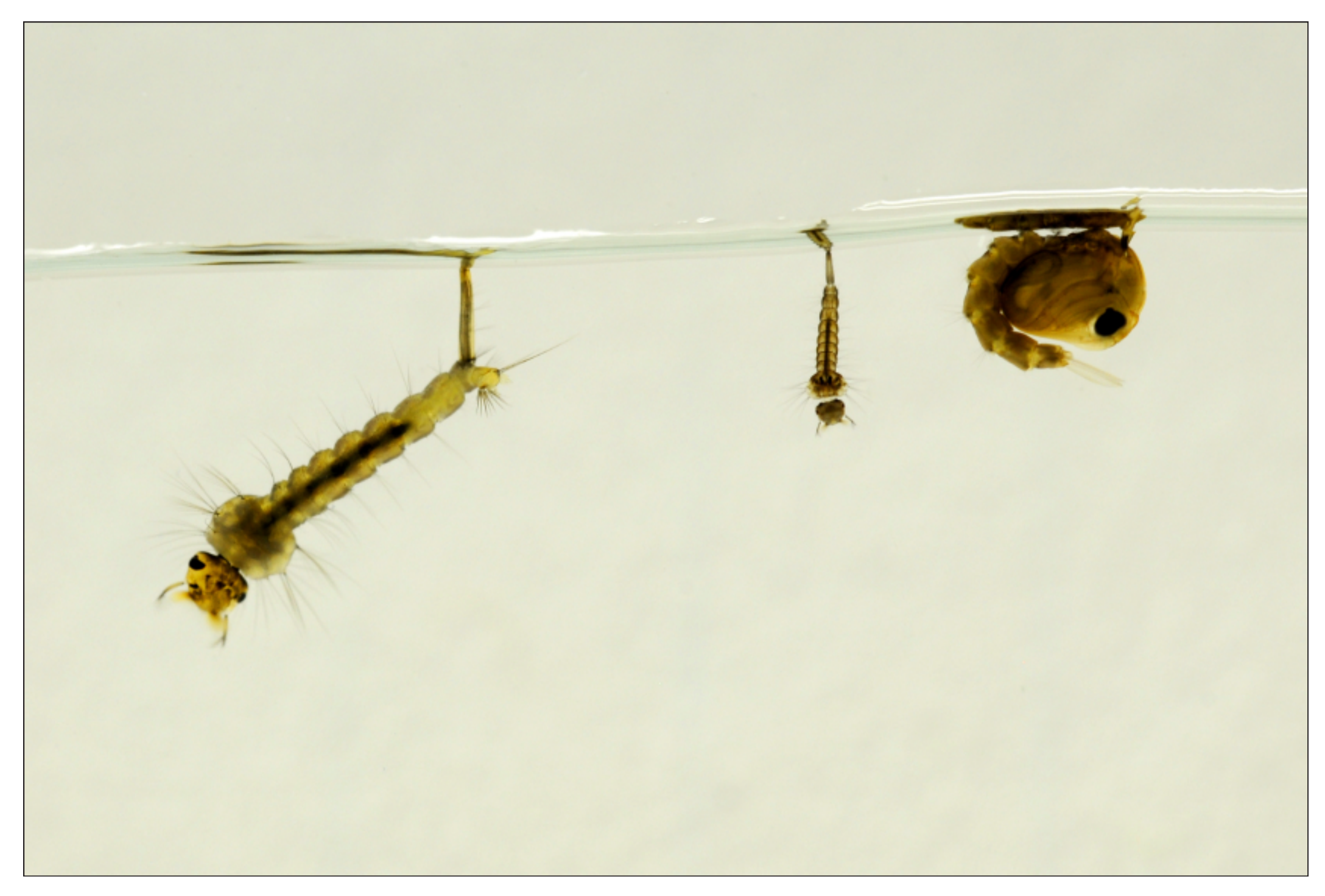
The pupa and larva stages of a mosquito's life are spent just under the surface of the water.