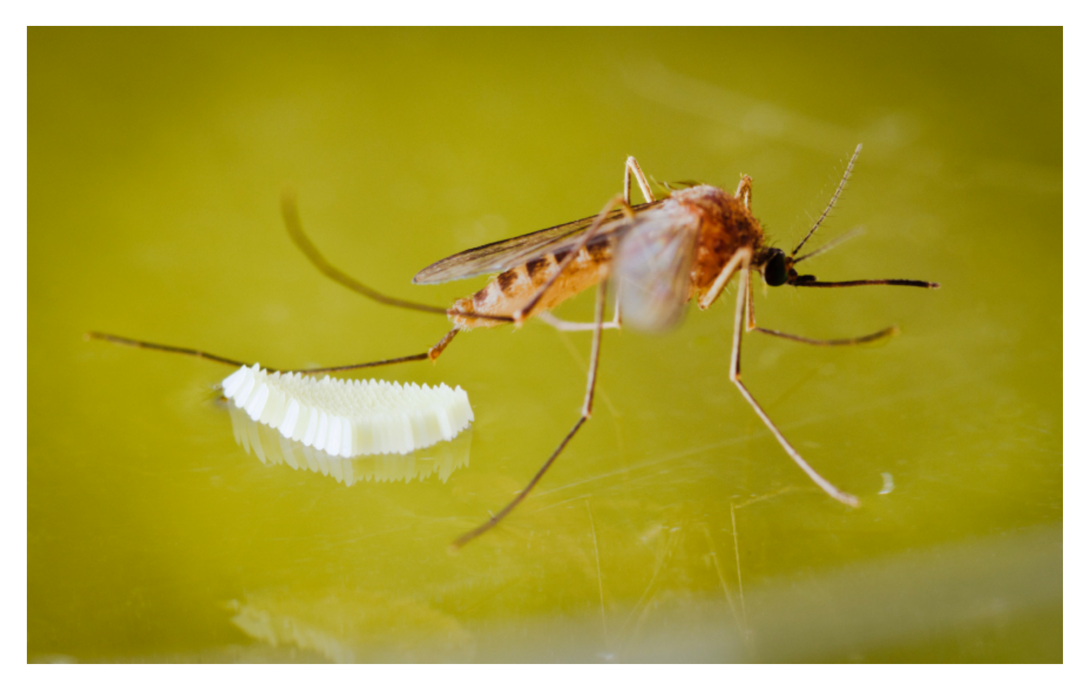
The mosquito lays eggs in a clump that floats on the surface of the water, like a raft.