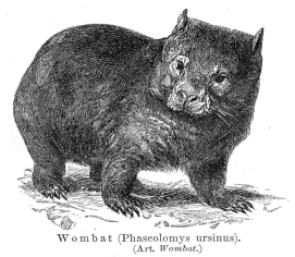
Wombat ( Phascolomys ursinus ). (Art. Wombat.)