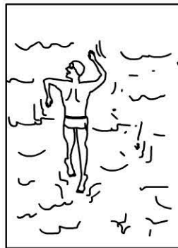
Swimming in cool water.

On a separate page, find an example for each colour and draw it.