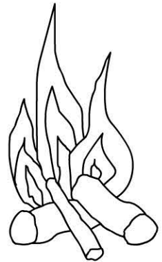
A warm fire.