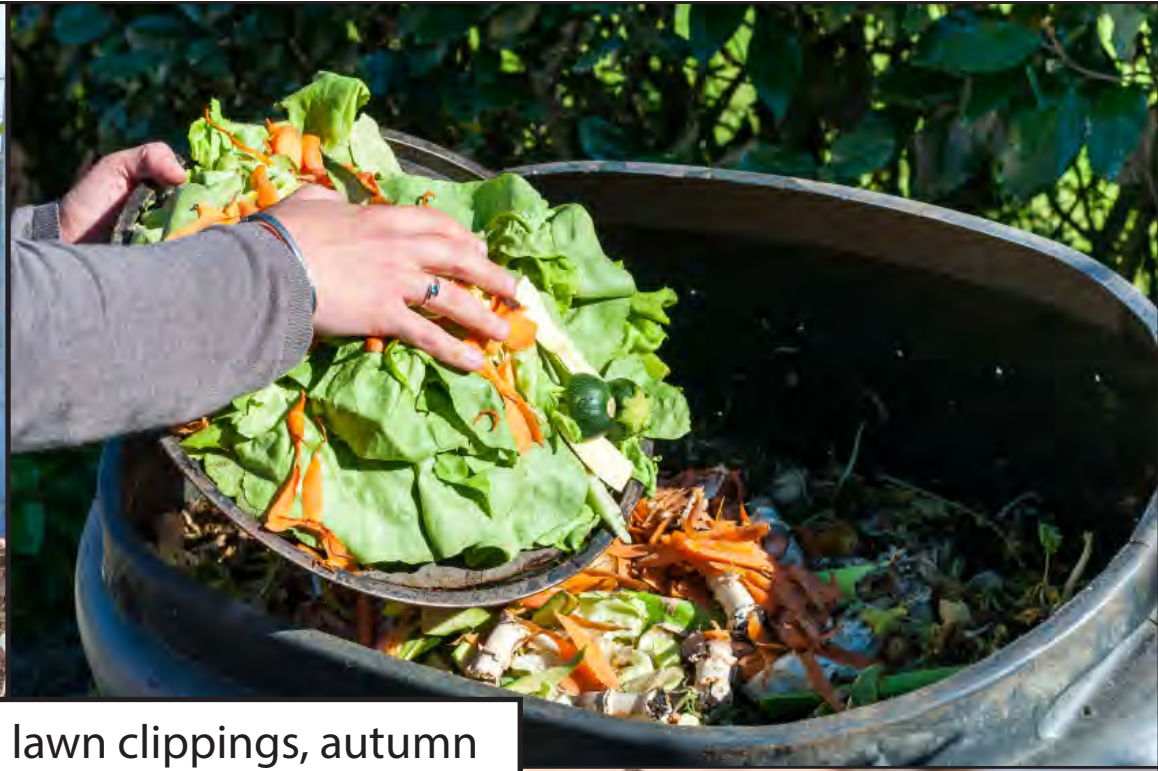
Food scraps, newspaper, lawn clippings, autumn leaves and and plant cuttings can be composted.