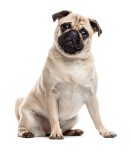
Describe the dogs